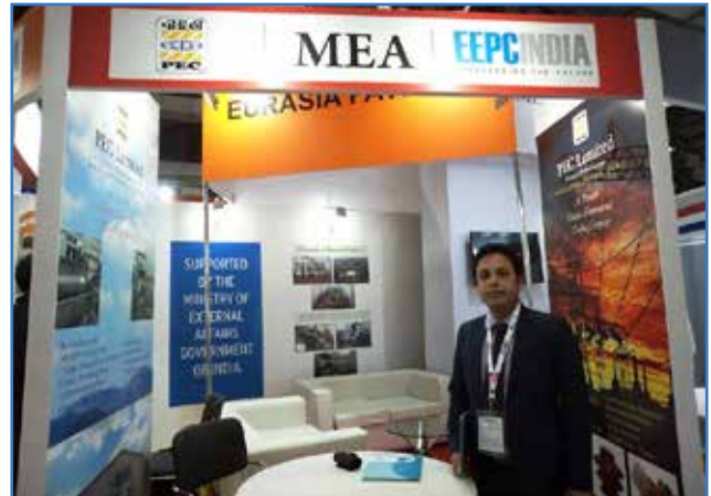
PEC participated in support of Ministry of External Affairs, Govt of India and EEPC India. pavilion displaying PEC's Project Exports.