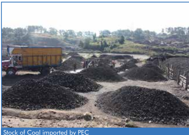
Stock of Coal imported by PEC

Your Company achieved sales turnover of ₹ 6186.76 Crore in the financial year 2014-15. Decline in turnover is due to sluggish economy, cessation of wheat exports & general slack in demand.