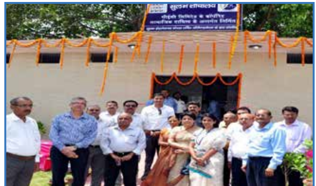
Swachh Bharat Abhiyan – Construction of Toilets Construction of 11WC+1 for PwD toilet complex at JJ Cluster , Block C&D, Distt Centre, Shalimar Bagh, Delhi through Sulabh International keeping in line with the Swachh Bharat Abhiyan.

PEC recognizes the essence of Corporate Social Responsibility & Sustainability. Significant efforts have been put in for identification of relevant projects that would make a positive and lasting impact on society, in line with the DPE guidelines. During the year, a sum of ₹2.15 Crore was spent on various CSR activities in community welfare initiatives.